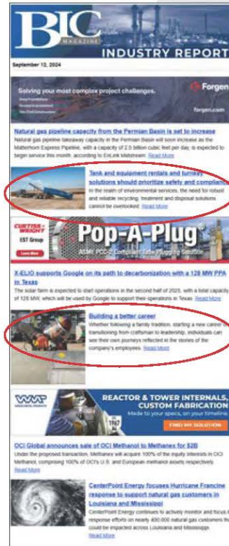
Native Ad #1 & #2 Examples (circled in red)